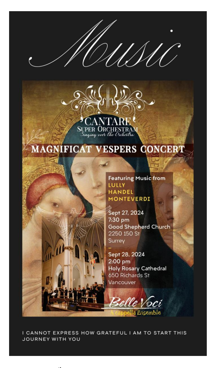
25<sup>th</sup> Sunday in Ordinary Time

Every Tuesday, from September 17 until October 15, from 7:30 p.m. to 9:00 p.m. via Zoom. The cost is $25. Learn more at beholdvancouver.org/events .