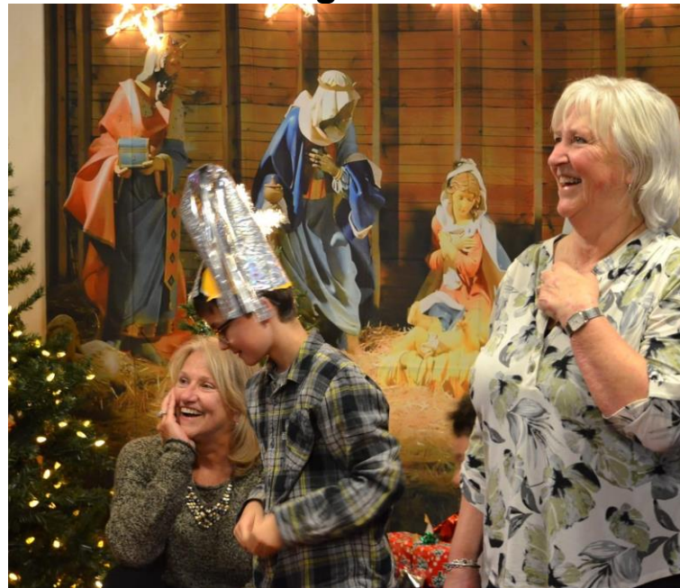
So Much Laughter!!!