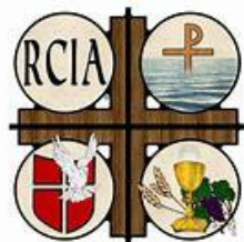
Rite of Christian Initiation of Adults (RCIA)

Are you interested in learning more about the faith and practices of the Catholic Church? Would you like to be part of journeying with the RCIA team?