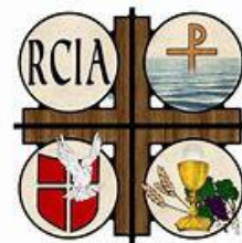
Rite of Christian Initiation of Adults (RCIA)

Are you interested in learning more about the faith and practices of the Catholic Church? Would you like to be part of journeying with the RCIA team?