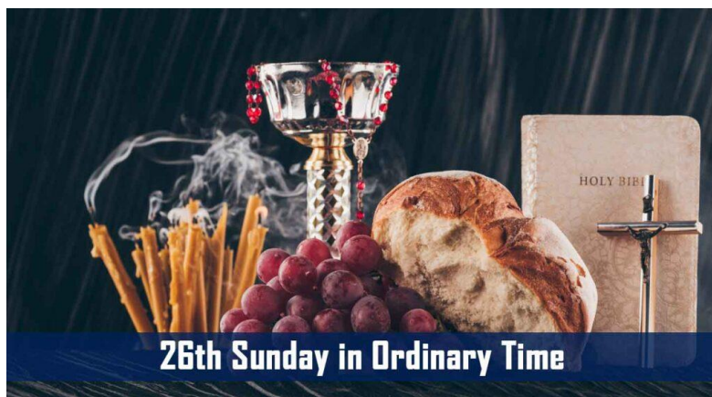
26th Sunday in Ordinary Time