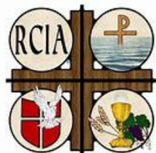
Rite of Christian Initiation of Adults (RCIA)

Are you interested in learning more about the faith and practices of the Catholic Church? Would you like to be part of journeying with the RCIA team?