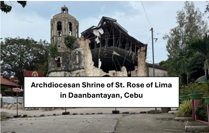
Archdiocesan Shrine of St. Rose of Lima in Daanbantayan, Cebu