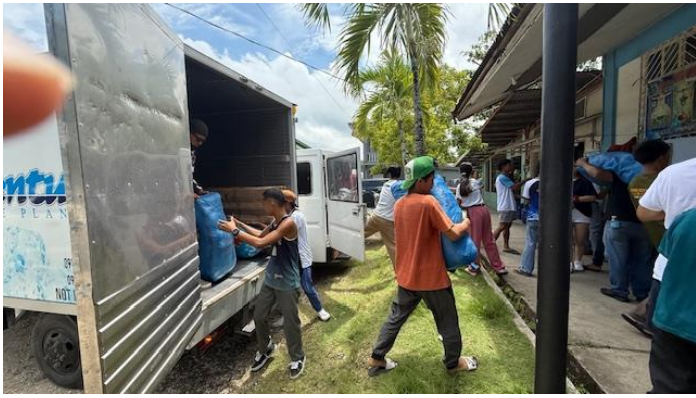
Truckloads of food & water because of your donations