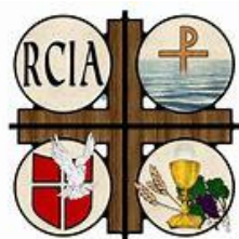
Rite of Christian Initiation of Adults (RCIA)

Are you interested in learning more about the faith and practices of the Catholic Church? Would you like to be part of journeying with the RCIA team?