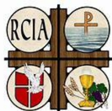
Rite of Christian Initiation of Adults (RCIA)

Are you interested in learning more about the faith and practices of the Catholic Church? Would you like to be part of journeying with the RCIA team?