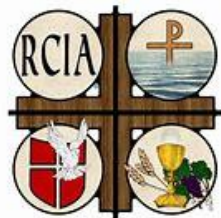
Rite of Christian Initiation of Adults (RCIA)

Are you interested in learning more about the faith and practices of the Catholic Church? Would you like to be part of journeying with the RCIA team?